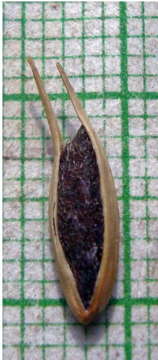
Figure 5.2 Moynatundi Rice from Odisha

Black rice is valued by many farmers and consumers for its black pericarp. Many farmers see beauty in the wing-like extensions of the sterile lemma in Moynatundi rice from Odisha (Figure 5.2) and Ramigali rice from Chhattisgarh, so they maintain these varieties on their farms.