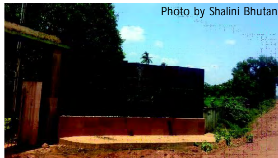
The CRRI is promoting hybrid rice in several parts of Odisha and India.